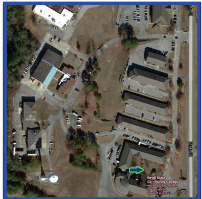
Sumiton Campus Free Speech Area is designated by a blue