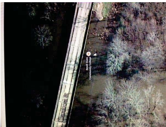
PCEC Free Speech Area is designated by a white arrow.